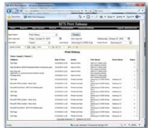
Print History... shows a complete list printed by an individual user