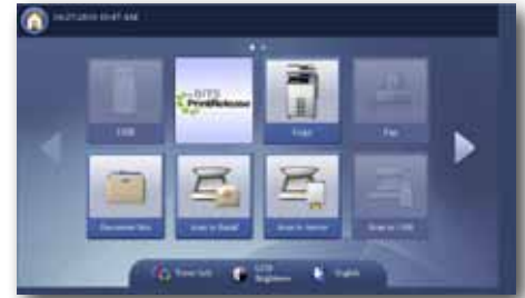
Log-in Screen... easy access from the device